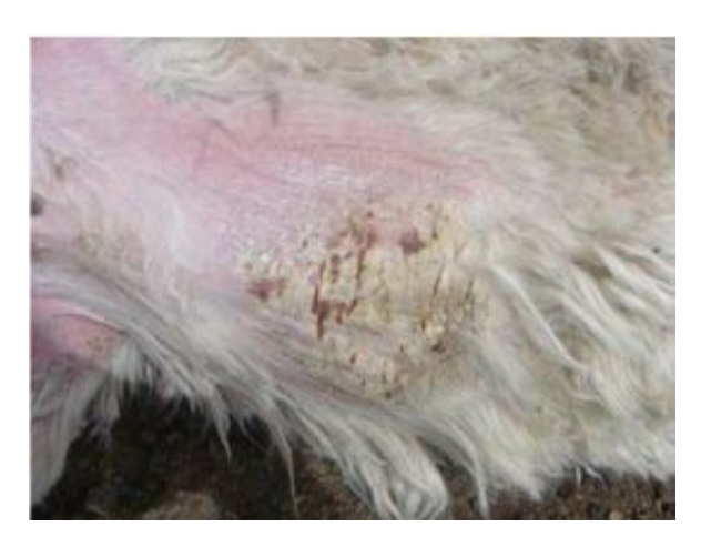
Figure 3: Sarcoptic Mange (Sarna) in Peru (Purdy, SR, Lessons Learned in the Peruvian Highlands).

(88.9%) evaluated were positive for trombiculosis. As infections had no correlation to pregnancy status or BCS score, these parasites seem to be more of a nuisance than a serious condition. A one time application of a topical petrolatum ointment is a very effective treatment against the mites.