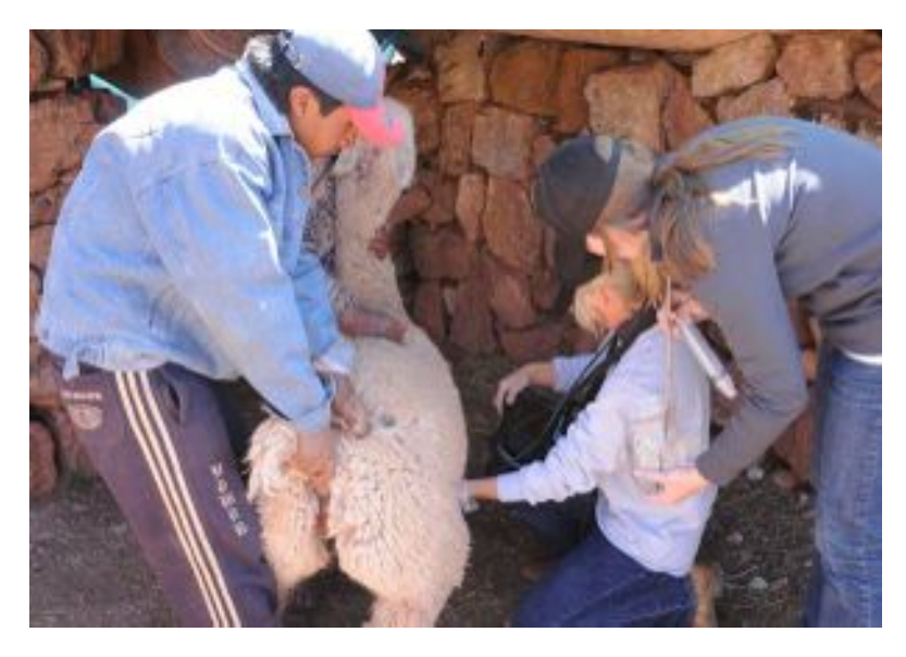
Figure 1: Determining pregnancy using the portable ultrasound. (Purdy, SR., Lessons Learned in the Peruvian Highlands)

reproductively are removed from the group. The teams also recorded the BCS for each of the selected females.